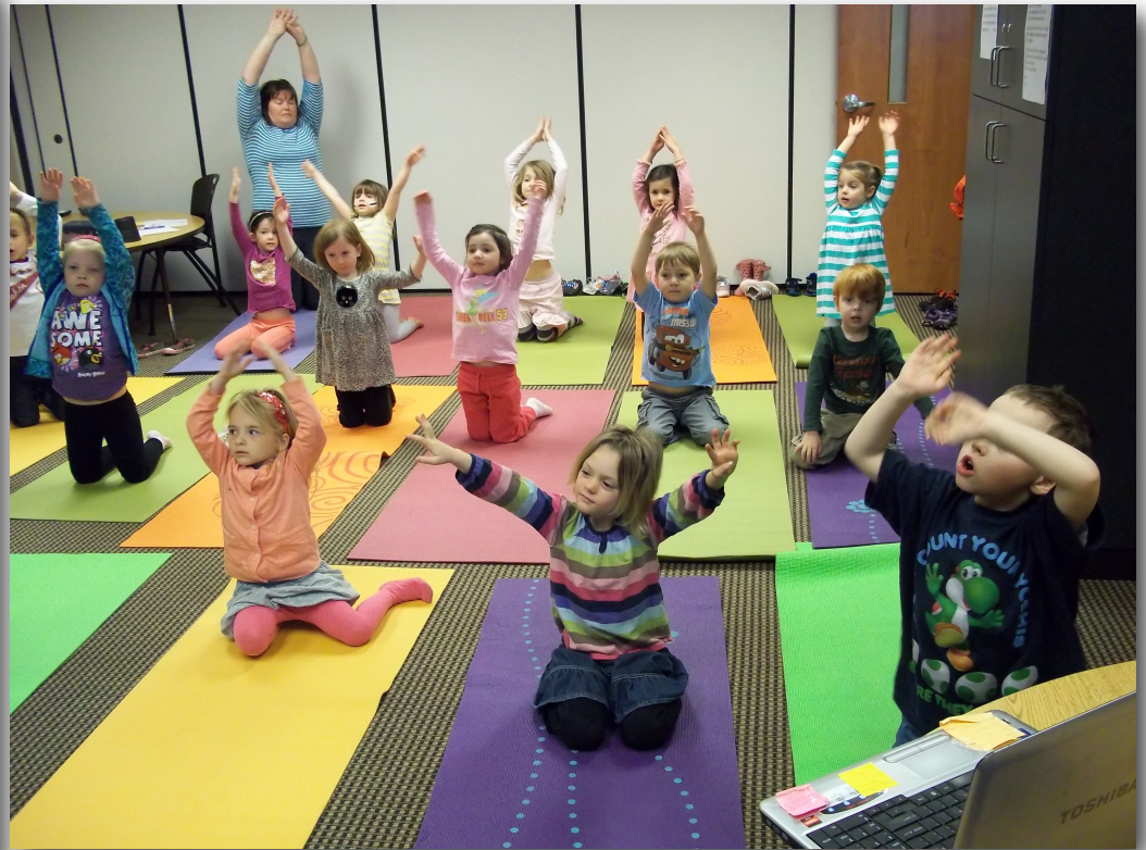
Children at local child care center during a Children's Council sponsored Angel Bear Yoga Class

225 Birch Street, Suite 3 Boone, NC 28607 828-262-5424 (phone) 828-264-8008 www.thechildrenscouncil.org